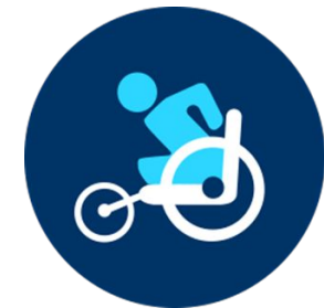
RECREATION, SPORTS AND LEISURE