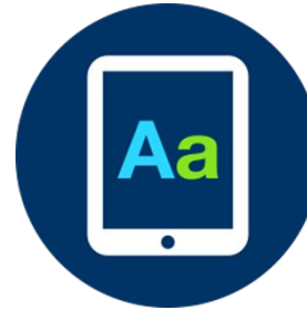
COMPUTERS AND RELATED