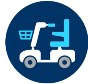
MOBILITY, SEATING, AND POSITIONING